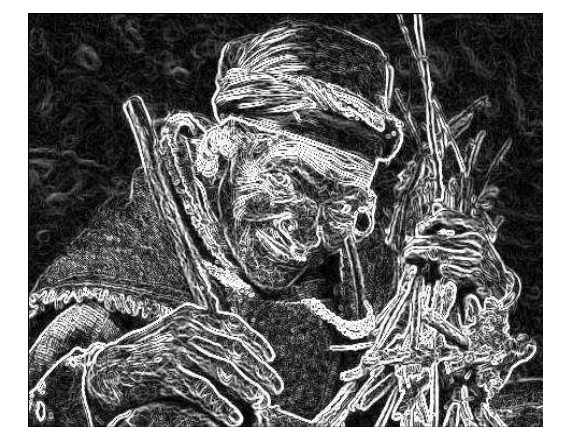
Fig 3 AFTER SOBEL APPLIED