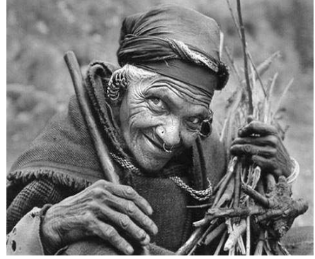
Fig 2 BEFORE SOBEL APPLIED

Sobel has a major pro of two ways that, the preamble of the middling factor, it has some downy effect to the slapdash hullabaloo of the image. It is the differential of two rows or two columns, so the fundamentals of the edge on both sides have been improved, so that the edge appears chunky and dazzling. The divergence between the original and sobel applied image is described in figure 2 and 3 as a result. From this sketch detection we further annotate an image for fast computation.